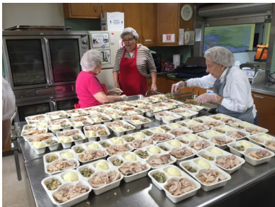
Volunteers from Westlake Meals on Wheels prepare box lunches and dinners for clients.